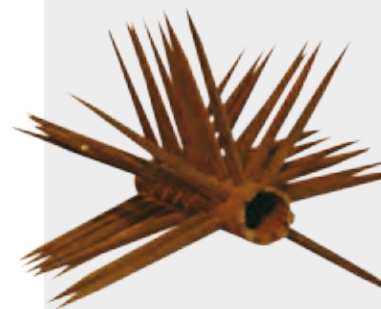
Rotating security spike Frieze originally mounted above internal prison gates to prevent escapes