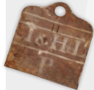
Solitary cell door plate, identifying the prisoner as: I - in irons HL - hard labour P - protestant

Thus, for the past 25 years, the site, having been stabilized and restored, is kept open for guided tours seven days a week, by a small dedicated group of volunteers. A gift shop has proven to be of immense interest and value to the tourists and public who visit the site.